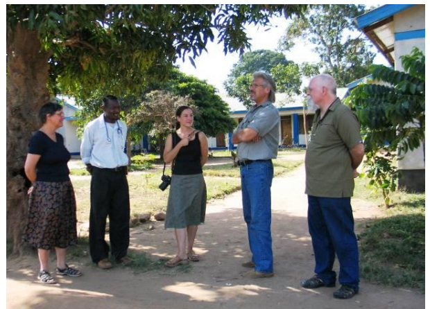
A visit to the new clinic on Ikuza