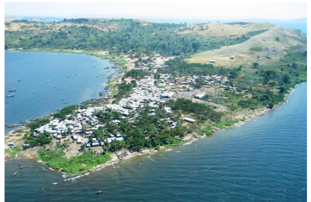
The island of Ikuza... one of MANY