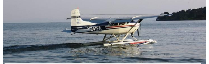
Travel by boat or plane to reach the islands

This month HIV has presented itself to me as a very REAL disease. The initial shock is wearing off, and I am ready to see God battle this disease in a way only HE can do. Let us join in prayer for these Brothers and Sisters who are being the hands and feet of Jesus and for the sick and weary who need to rest in our Saviors welcoming arms.