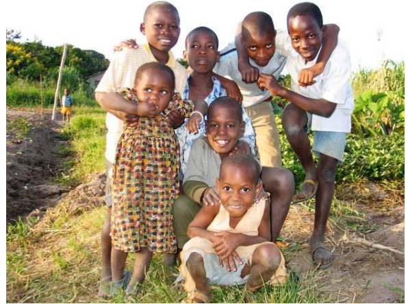
So many children on the islands