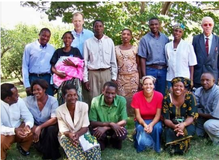
On the final day of class, my classmates, their wives and our teacher joined together for a time of celebration.

Being a part of the NTC class was a great reminder of how important it is to be in a study group with others. Diving into the word together is a bonding experience and a great encouragement as well. Please pray for me about how I can find a more permanent study group for myself, and how I can encourage the kids to also join a group.